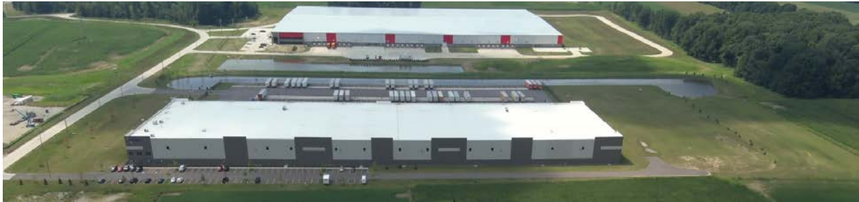
2023 Aerial showing the completion of the Wooster Brush & Frito-Lay expansions.