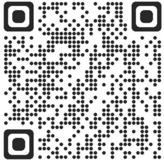
SR 83 Major Rehab Project Website